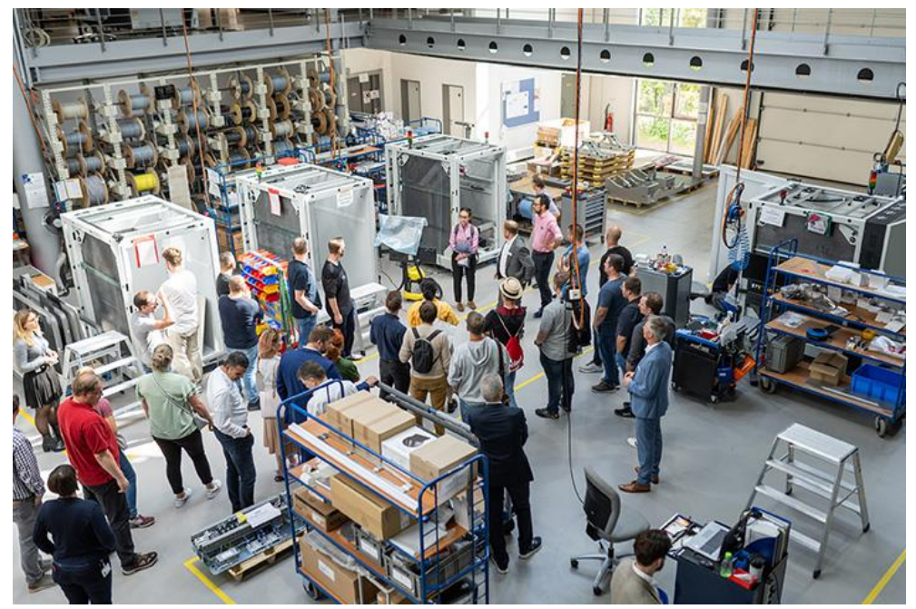
Company tour behind the scenes at Viscom