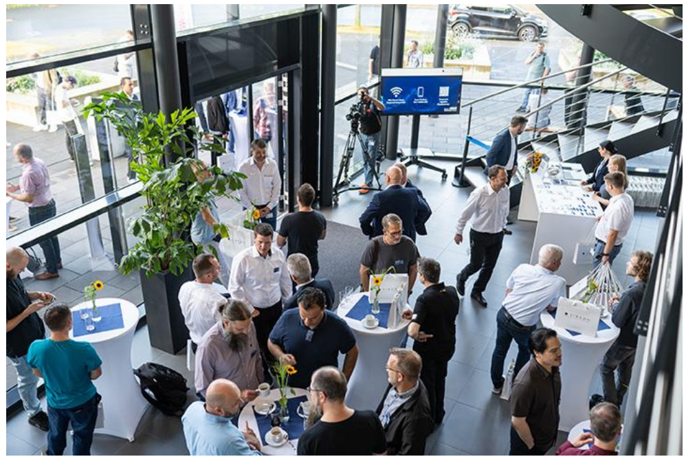
The light-flooded foyer of the Viscom Customer Center shortly before the start of the Technology Forum