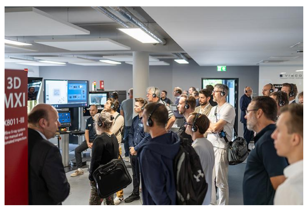
During the Innovation Tours, visitors were able to learn more about Viscom's inspection systems live and up close