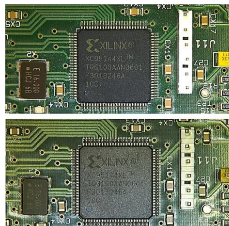
Print vs. laser etched